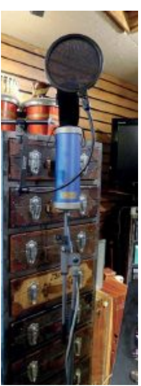
A Blue Microphones bottle